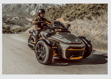
SPECIAL SERIES: A special package for the sport enthusiasts that come pre-equipped with several accessories and custom graphics.