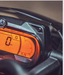
DIGITAL GAUGE: 7.6" wide digital display with a simplistic design to see everything you need.