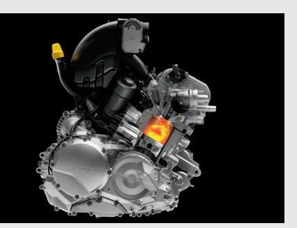
ROTAX 1330 ACE ENGINE: 115 hp engine. More power can only mean one thing – better performance. Our most powerful engine allows you to challenge the road knowing you have the horsepower you want when you need it.