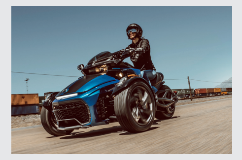
VSS: Vehicle Stability System that uses a variety of technologies, including ACS / ABS / TCS, to monitor the vehicle and keep the rider confident on the road.