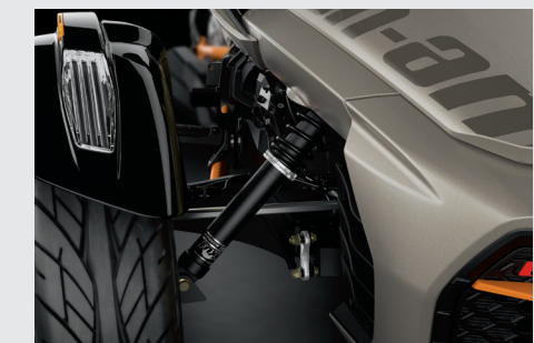
FOX SHOCKS: Sport-tuned, gas-charged front shocks give you a responsive, sporty feel and great performance on the most demanding roads.